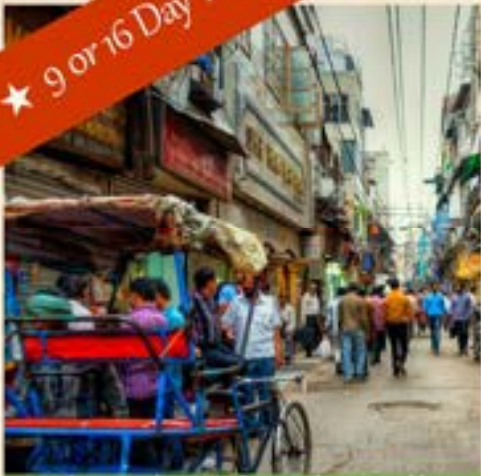
Chandni Chowk, Delhi