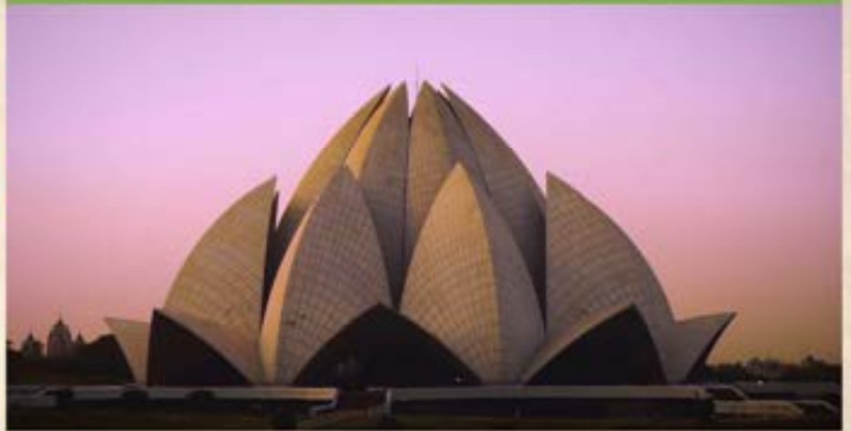
Lotus Temple, Delhi