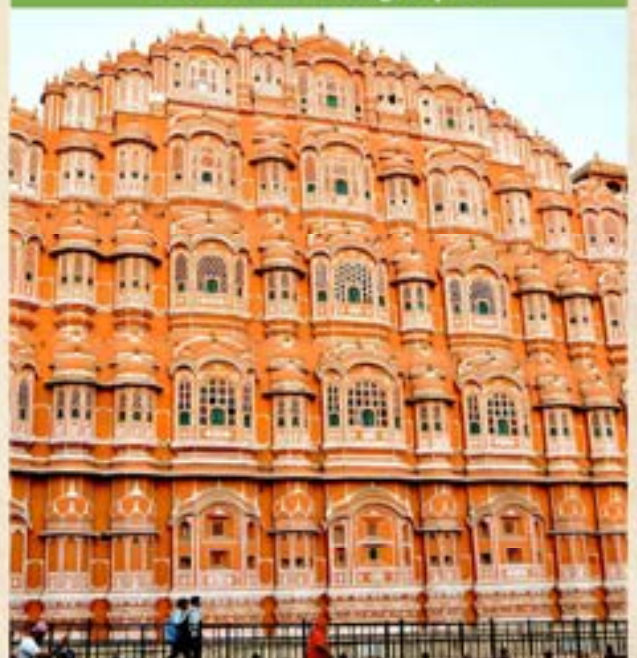
Hawa Mahal, Jaipur